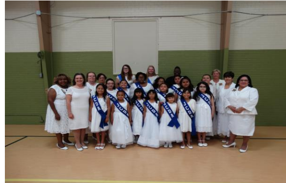
Court Our Mother of Love # 2092 Houston, Texas -- Instituted 5/21/16