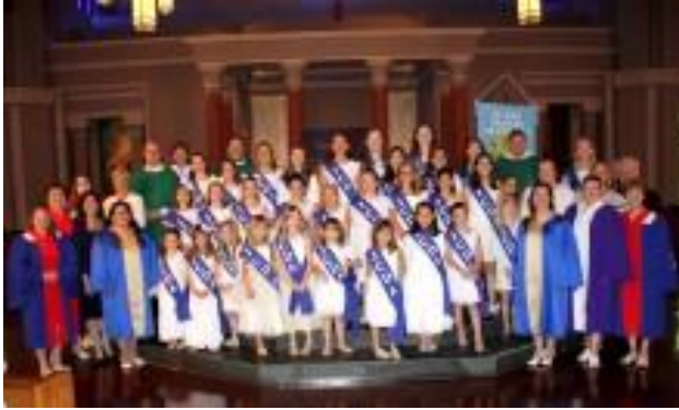
Court St. Jane Frances de Chantal # 2699 The Woodlands, Texas – Instituted 5/21/16